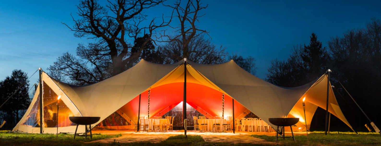
A set of window and side panels are included, each wall can be opened and rolled up to create a large opening.